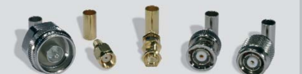
Reverse Polarity Connectors for Wireless LAN